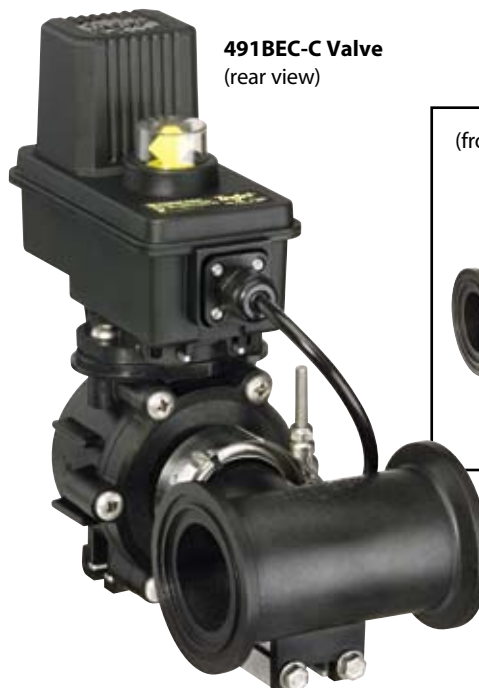
491BEC-C Valve (rear view)