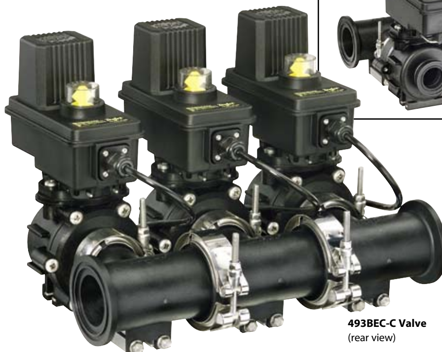
493BEC-C Valve (rear view)