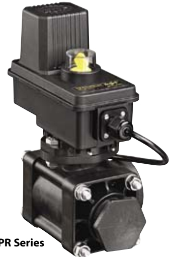
346 BPR Series