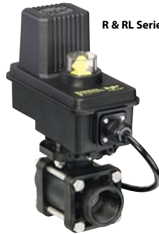
R & RL Series