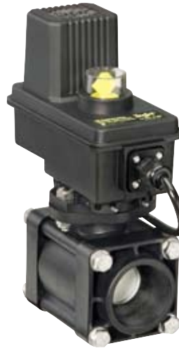
346 R Series