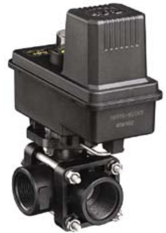
344 BPR Series